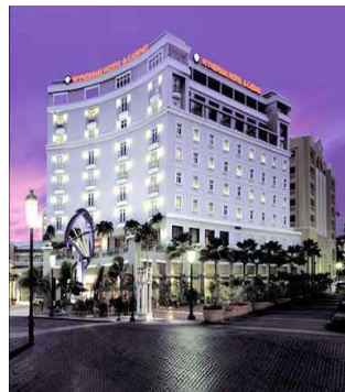
Sheraton Old San Juan is located at 100 Brumbaugh Street, across from the Cruise Ship Pier No. 2 on the Old San Juan Bay. For reservations call 1-800-325-3535

sans and local shops. The hotel is only six miles from the International airport. Renovations include guestroom and casino refurbishments, construction of new meeting space overlooking San Juan harbor, as well as a redesign of the property's indoor/ outdoor restaurant.